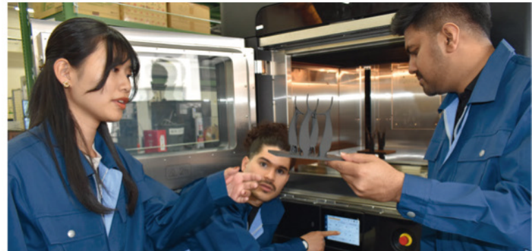
3D printing to create a product prototype

abroad programs, and conduct overseas staff training to enhance globalization and specialization of our staff. Through such initiatives, we believe that globalization and diversity within the campus are being promoted. One of our Japanese graduates who had overseas OTJ experience in a partner company became the president of the firm's