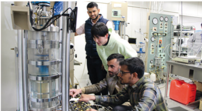
Prepared triaxial apparatus for soil testing

"In the future," he adds, "we are seeking partners with whom we will work together to develop engineers in countries and regions where industrial development will accelerate."