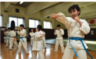
Karate practice (club activity)